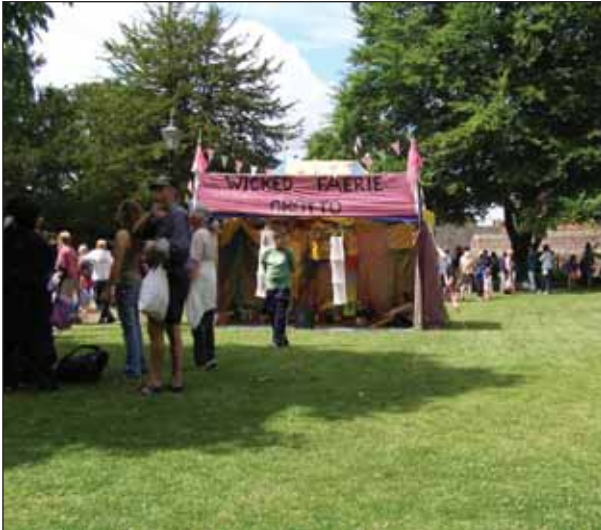
The Faerie Grotto, Winchester Hat Fair.