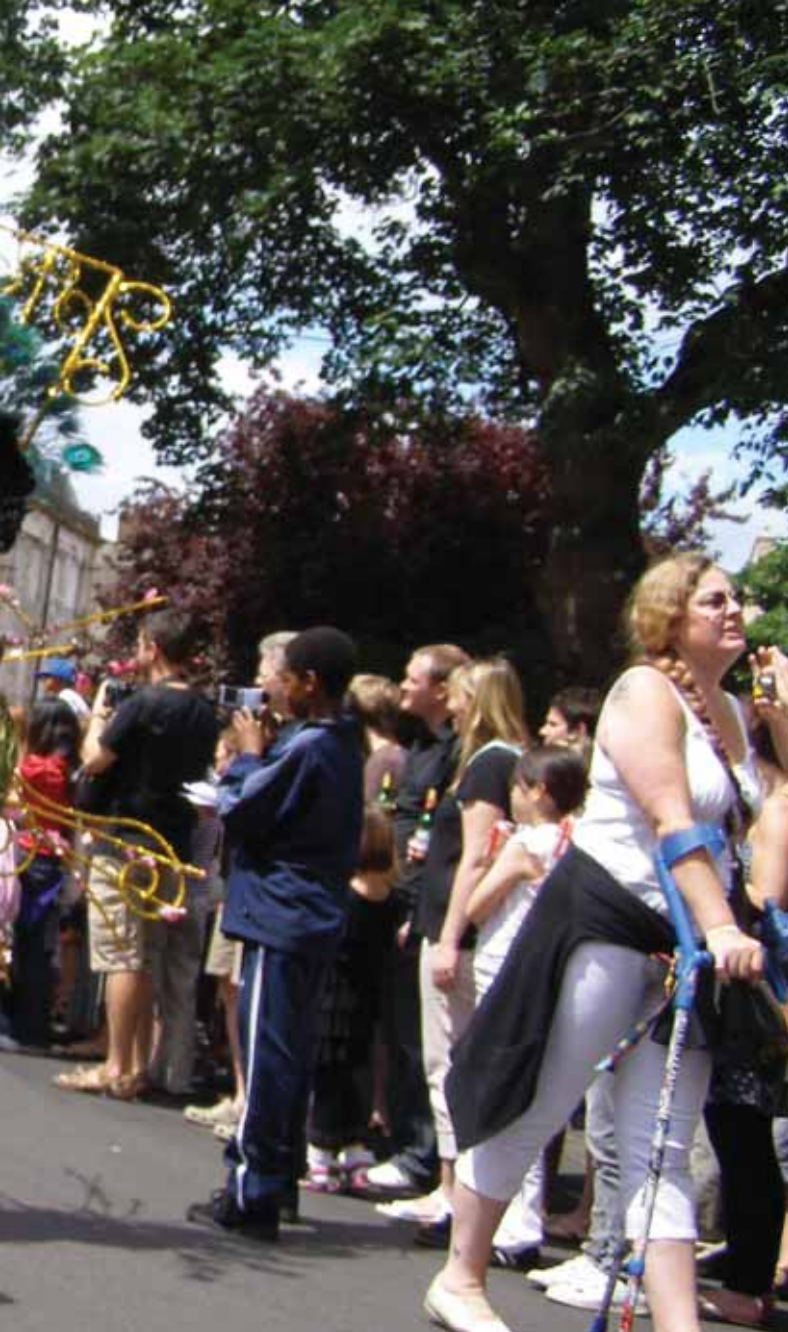
Attitude is Everything Archive

position. Where applicable, this should be advertised in the access section of promotional material. A designated accessible dropping-off point for people with visual and mobility impairments is vital.