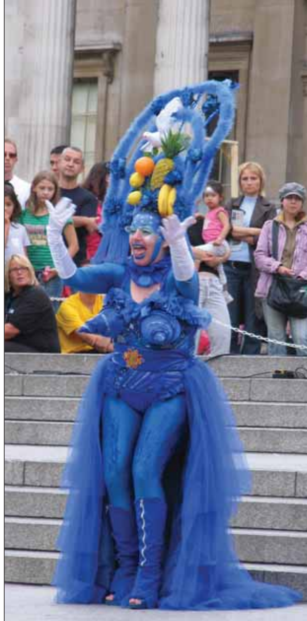
The Alexandras, Graeae Theatre Company, Liberty Festival.

Please see Appendix 4 for Shape’s Top Tips for commissioning Deaf and disabled artists.