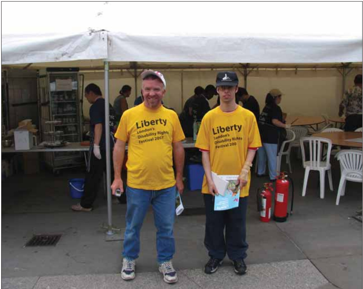
Stewards at Liberty Festival.