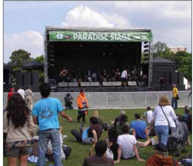
View from the viewing platform at Paradise Gardens festival.