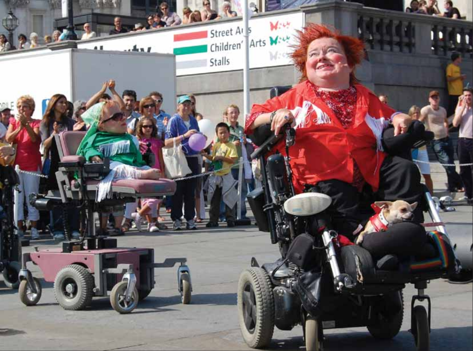
Rhinestone Rollers, Graeae Theatre Company, Liberty Festival.