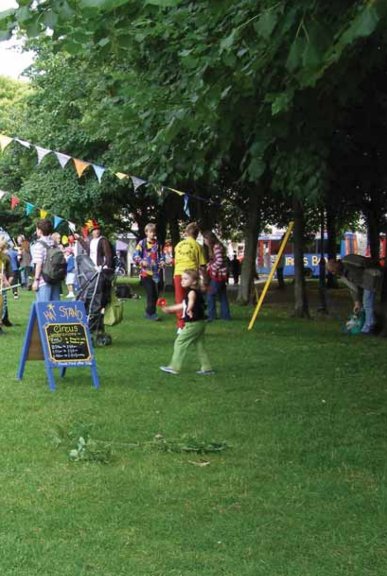
Attitude is Everything Archive

Temporary tracks: Lay temporary tracks or matting for wheelchair users and other people with mobility impairments to stop them sinking into the mud. You also need to make sure there is enough space for cars and wheelchair users to pass each other.