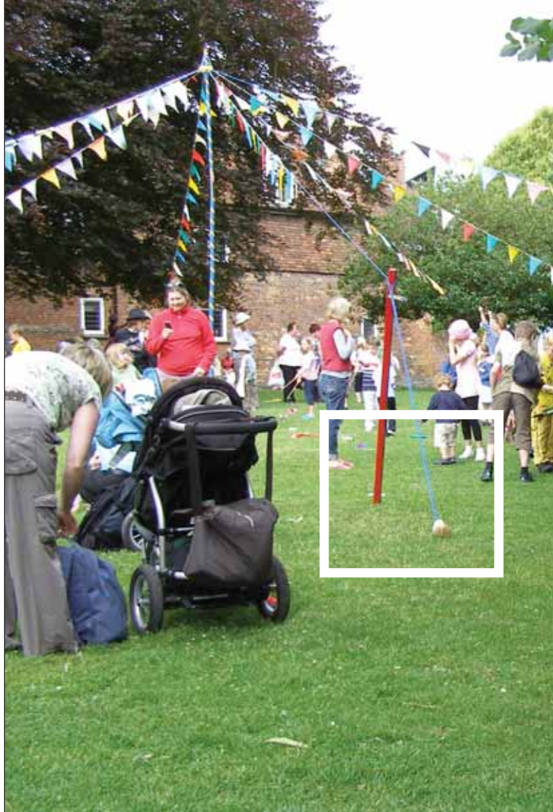
Example of a guy rope that needs highlighting.