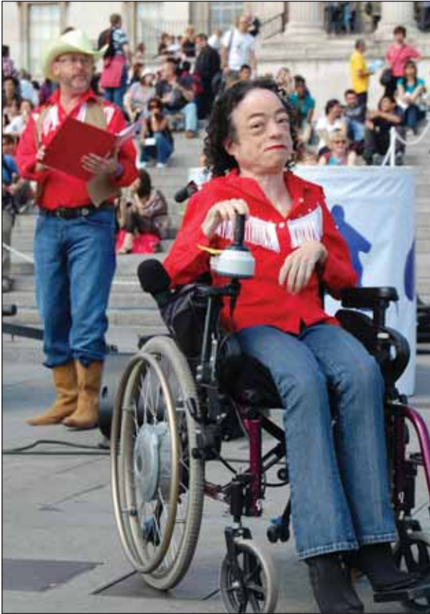
Rhinestone Rollers, Graeae Theatre Company, Liberty Festival.