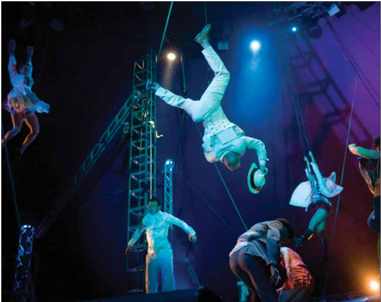
NoFit State Circus, Paradise Gardens. Attitude is Everything Archive