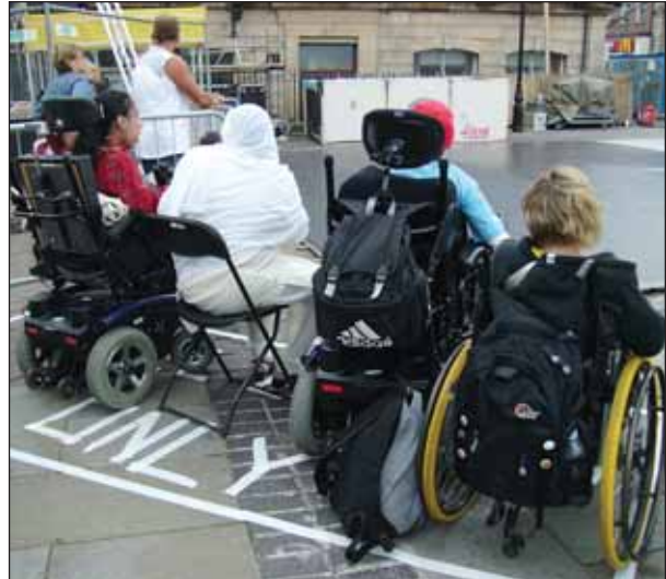
Wheelchair user's viewing area, SIRF.