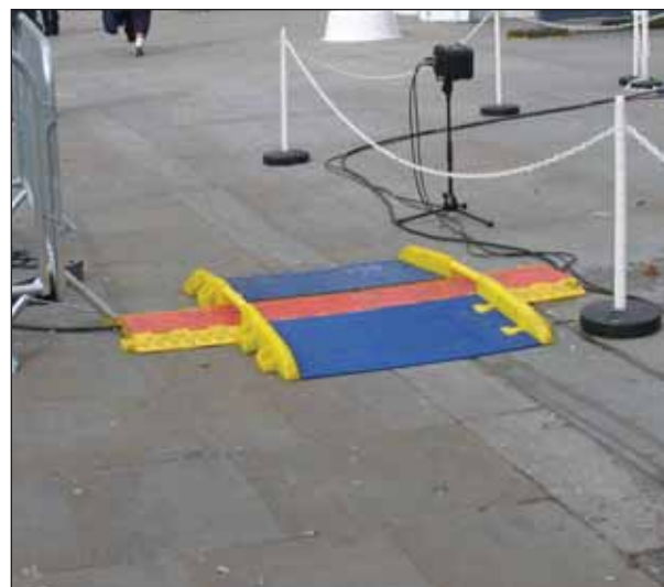
Highly visible, wheelchair accessible cable ramp.

Dedicated routes: Providing separate, dedicated routes for disabled people is a great idea. Maybe they can use backstage short-cuts, especially in an emergency situation or if there is crowding or queuing at an entrance.