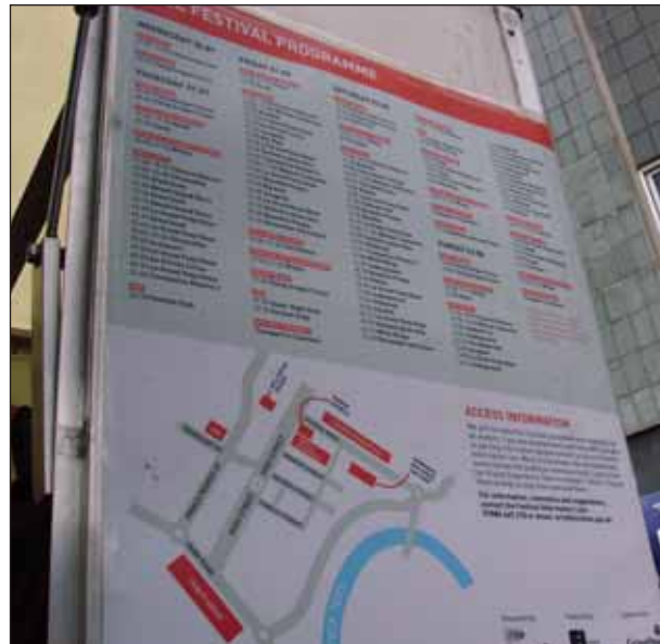
Wheelchair users' view of festival signage.

Orientation: A large 'You Are Here' style site plan should be located at the entry points into the festival locations, where there are multiple pitches, tents or stages, for people to orientate themselves as they arrive.