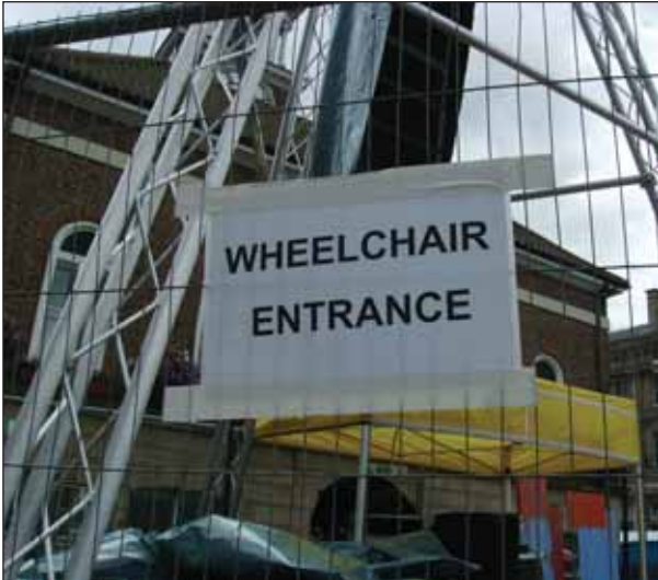
Wheelchair Entrance signage, SIRF.