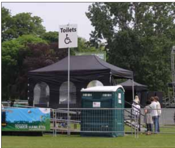
Accessible toilet sited by viewing platform.