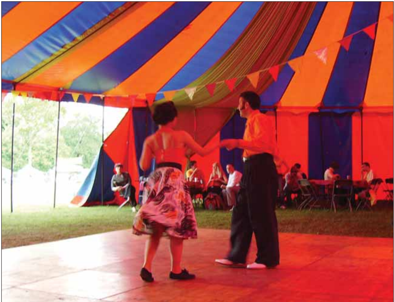
The Tea Dance Tent at Paradise Gardens.