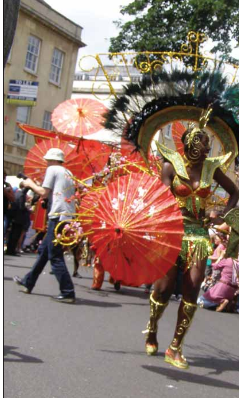
St Paul's Carnival.