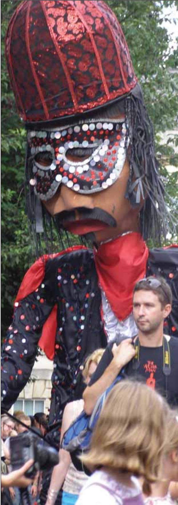
St Paul's Carnival.

stages through a combination of being given a site map in advance and a walk around the carnival area prior to the event starting.