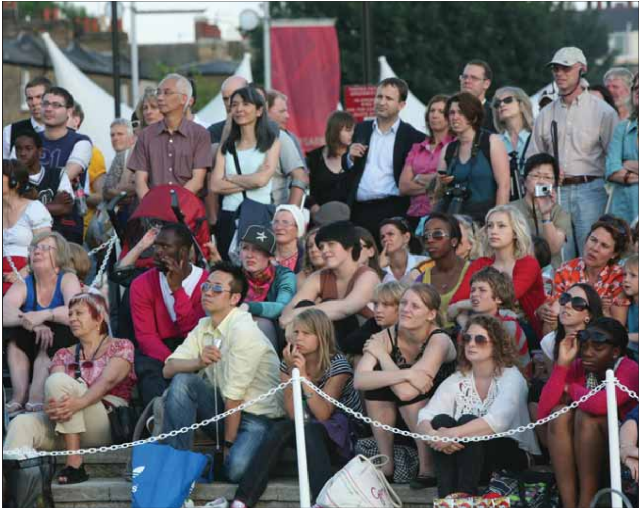
Audience at GDIF.