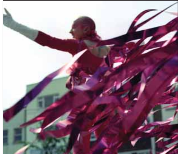
The Alexandras, Graeae Theatre Company, SIRF.

Dealing with last minute changes: Be clear on how last minute changes will be communicated. Try, however, to minimise these. If unavoidable, be clear about what is happening and what is required of the performers. The Stage Manager should always try to talk to the same contact for continuity and clarity. Attempt to avoid changes that can disorientate, for example altering which side of the stage performers