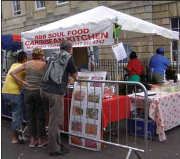
Food stall at St Paul's Carnival.