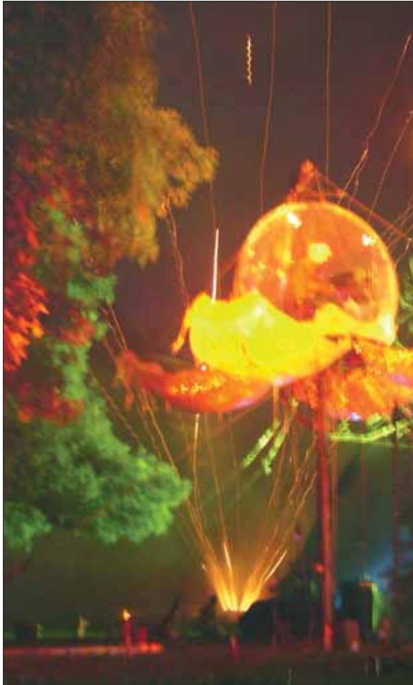
Fireworks, SRIF.