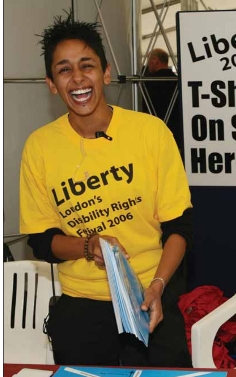
Information Point, Liberty Festival.