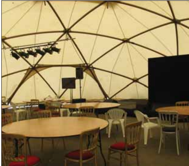
A tent offering a range of seating.