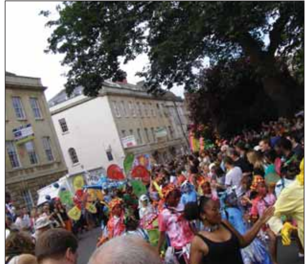
Crowds at St Paul's Carnival.

they were held up by their parents) as those standing blocked their views.