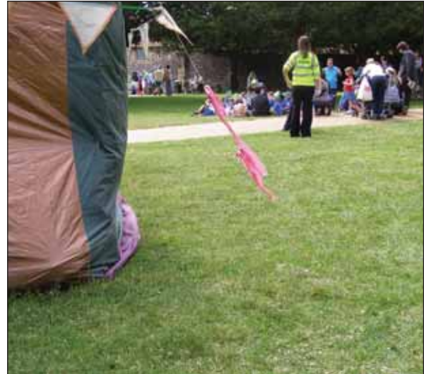
The Faerie Grotto guy ropes, Winchester Hat Fair.

written. That was useful, but not very accessible to anyone with a visual impairment.