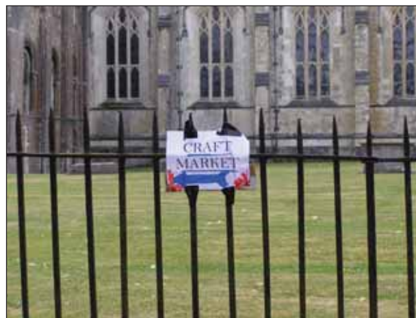
Temporary signage.

Alternative formats: Tactile plans are a great idea for people with visual impairments. Signage that uses symbols or pictures is not only accessible for people with learning disabilities, but also for people for whom English is not a first language.