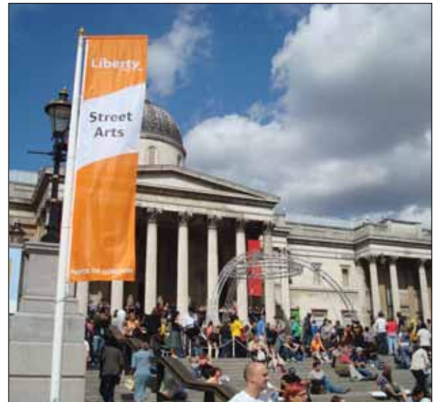
Both images: Liberty Festival, colour coded zones. Brian Oakaby

also getting there and finding ways it can be accessed. It is therefore important to mark clearly on your website and all pre-event information: public transport, any parking facilities, drop-off points for disabled people, distances to cover between these and the festival and the type of surfaces, (tarmac, gravel, grass), and terrain, (hilly, flat, uneven). Include links to journey planners for local public transport, which have information about accessible buses and trains. Having stewards at the local station directing people is also enormously helpful. By flagging this up on your publicity and website you will encourage Deaf and disabled people to attend.