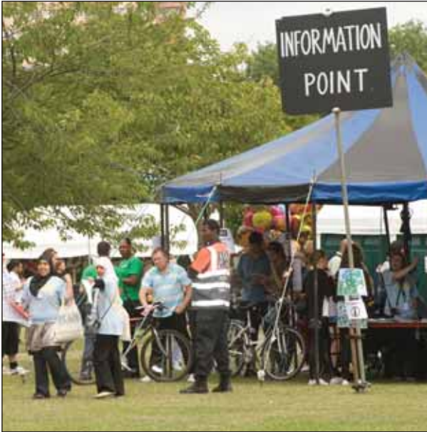
Information Point, Paradise Gardens Festival.

understand that some elderly and disabled people will not be able to stand in queues for very long and therefore stewards need to set up some sort of ‘fast track’ system where people can go in first or have a seat whilst queuing.