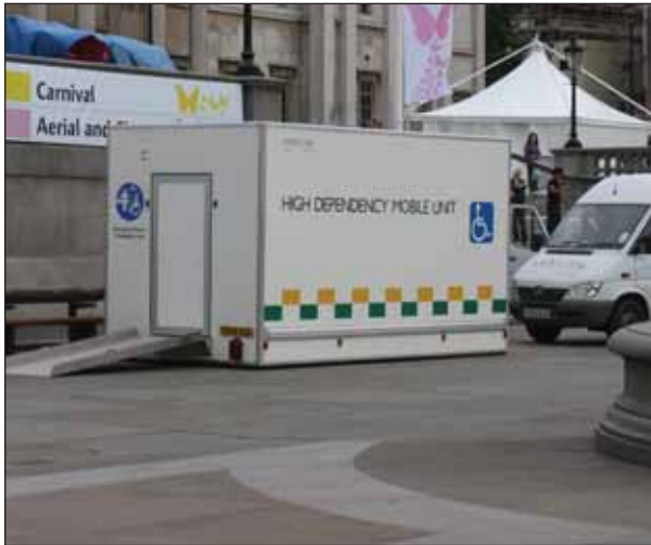
Mobile “Changing Places” toilet. Liberty Festival.