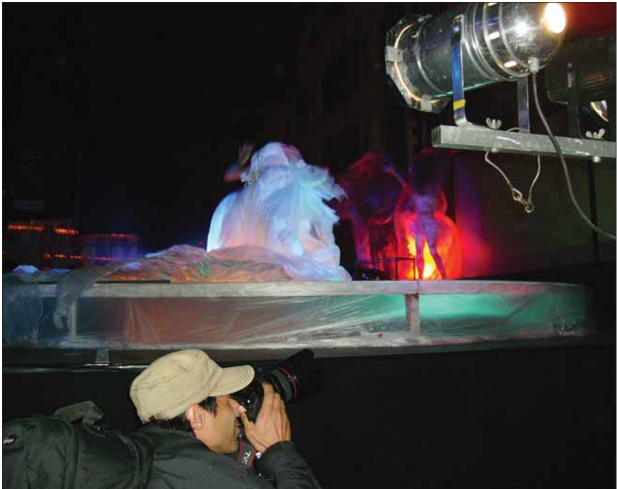
Wheelchair user's view, Remember the Future, SIRF.