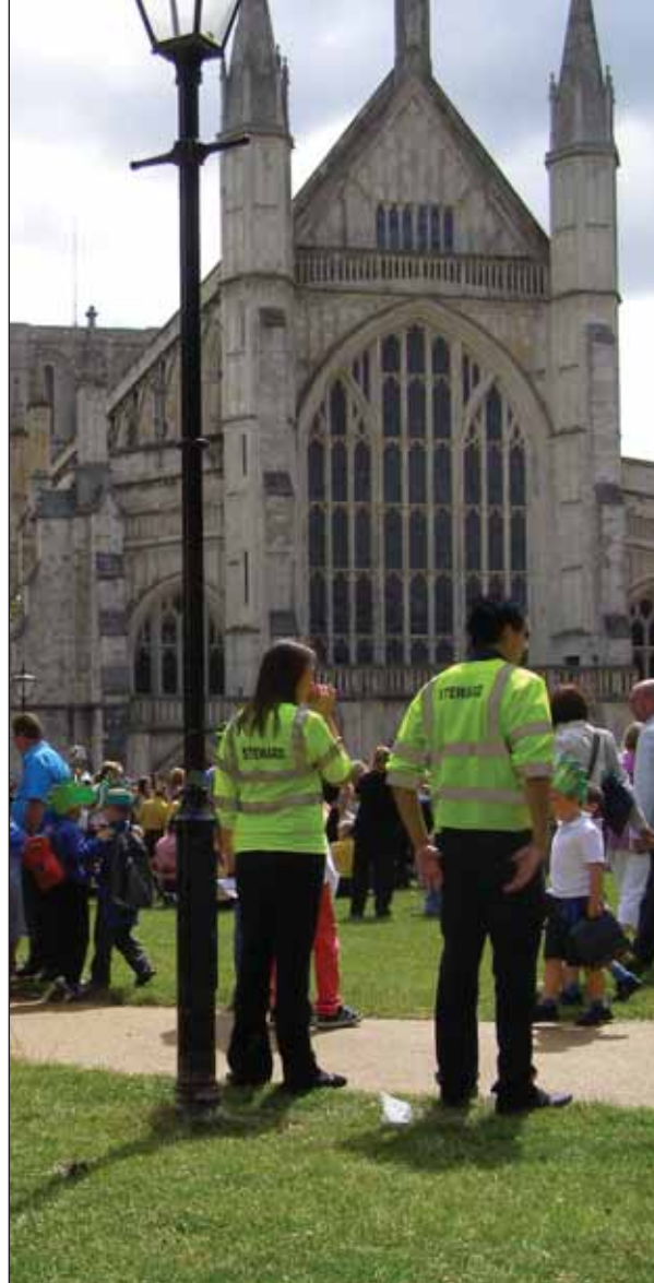
Stewards at Winchester Hat Fair.

Visibility: Stewards need to be easily identifiable to Deaf and disabled visitors.